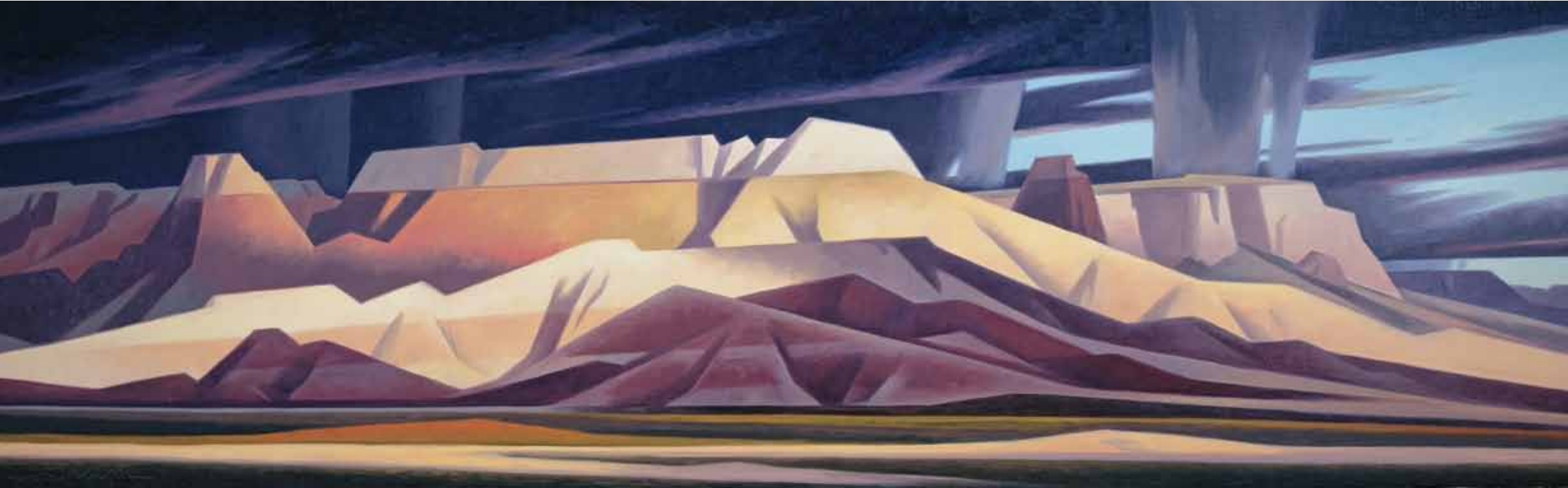
Shaded Desert , d.2011, oil on linen, 20 x 64 inches