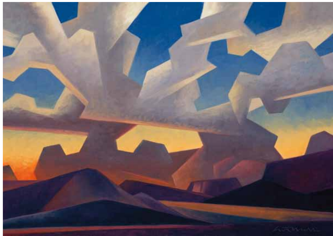
Expanding Sky , d.2011, oil on linen, 16 x 22 inches