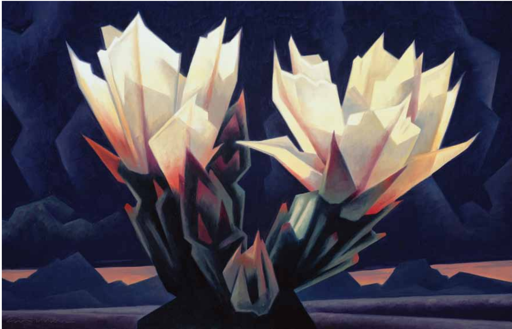
Storm Flowers , d.2011 oil on linen 20 x 28 inches