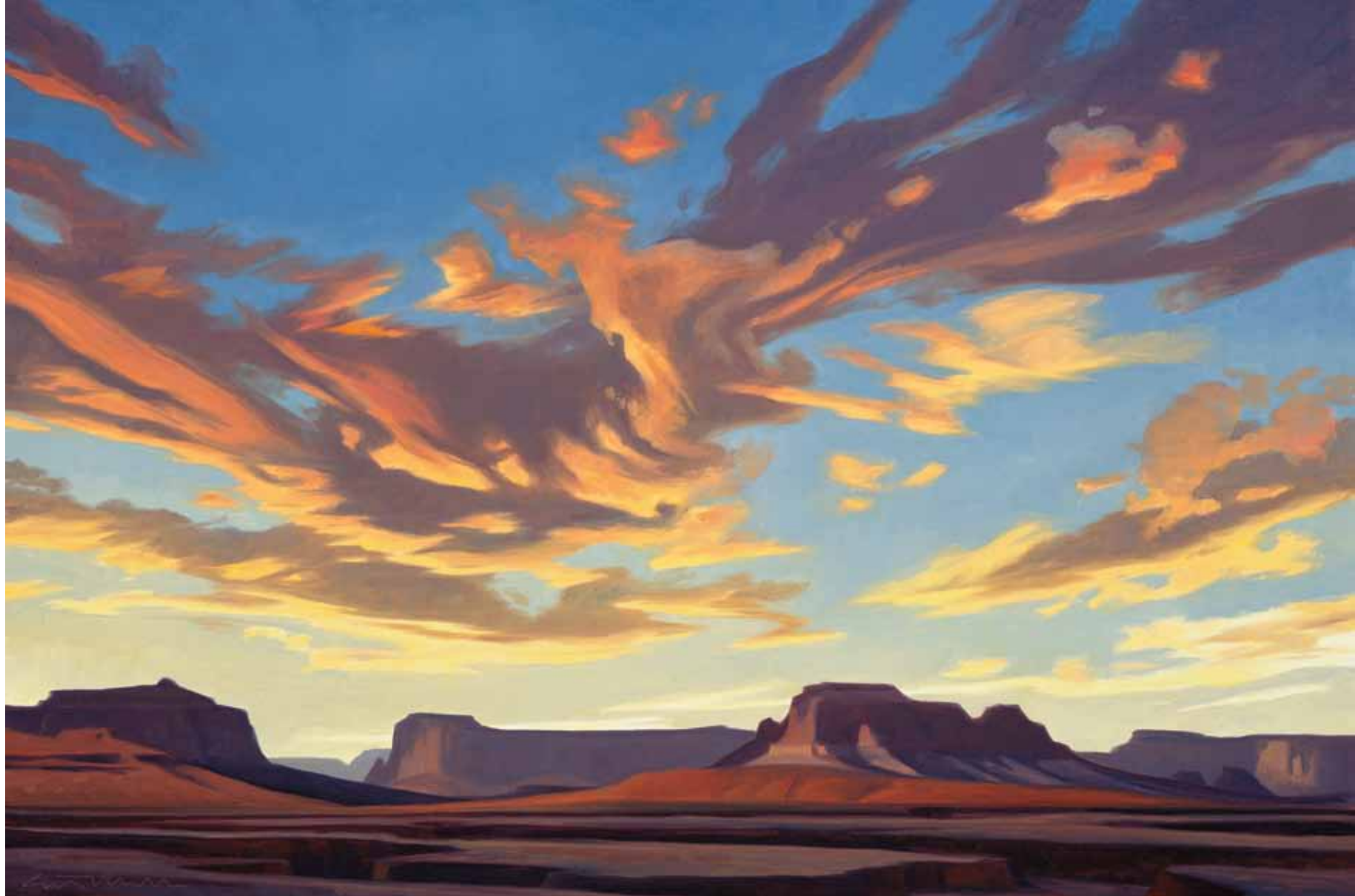
Spiral Sundown , d.2011 oil on linen 44 x 56 inches