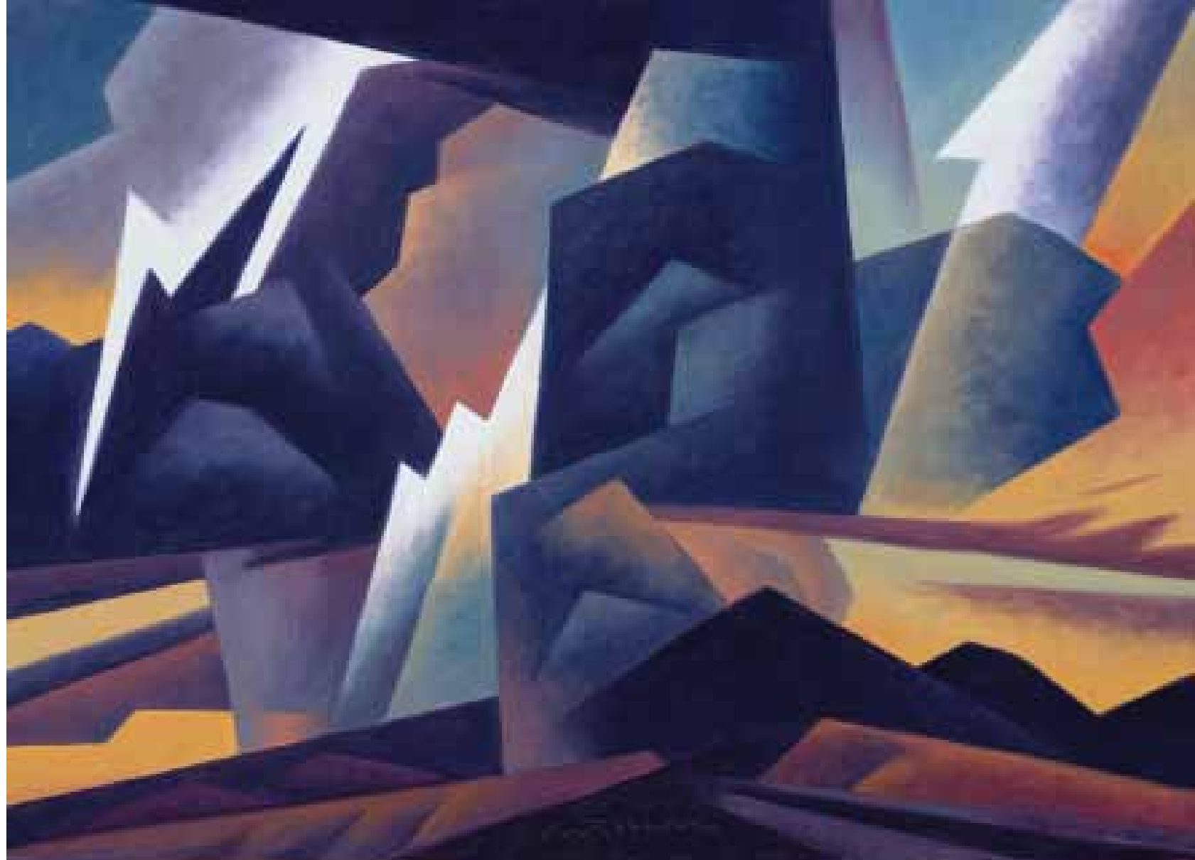
Clashing Storm , d.2011 oil on linen 30 x 40 inches