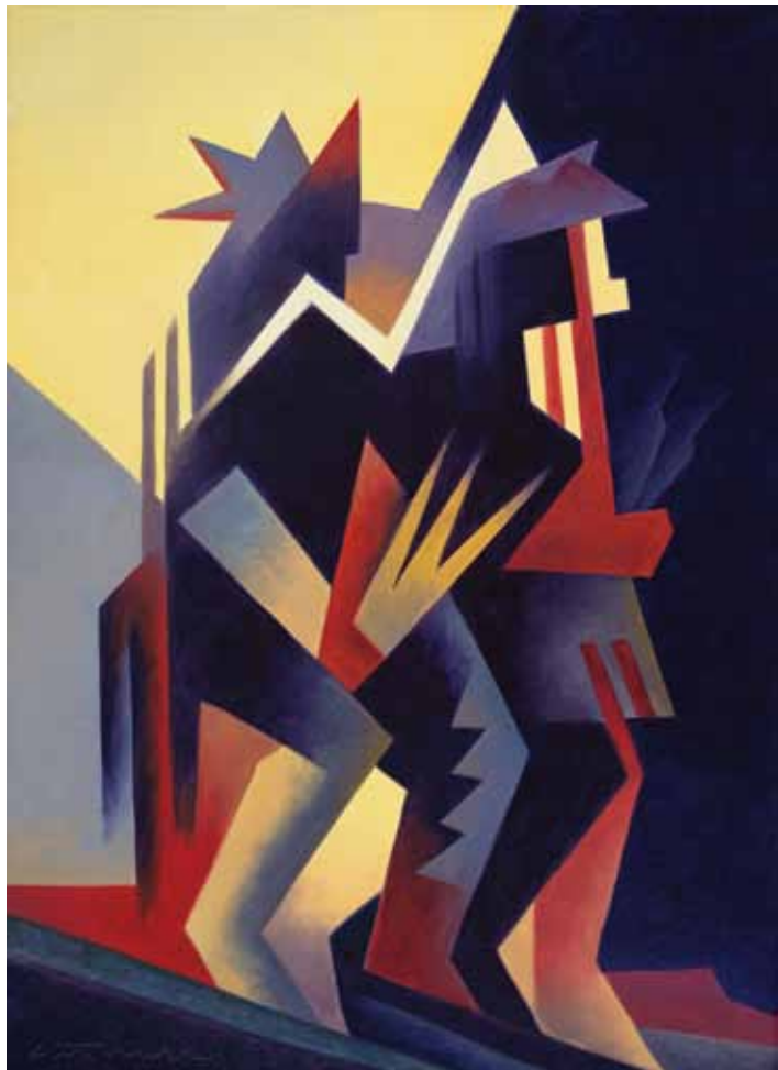
Light into Dark , d.2011, oil on linen, 22 x 16 inches