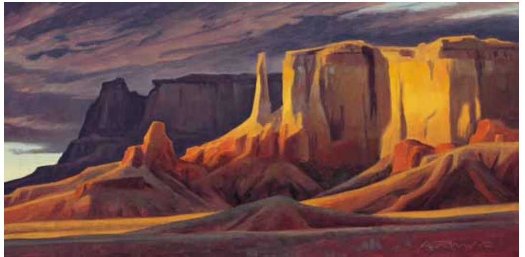
Yellow Mesa , d.2010, oil on linen board, 10 x 20 inches