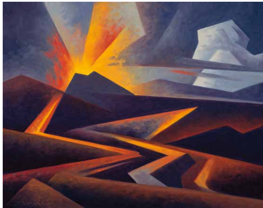
Volcanic Fields , d.2011, oil on linen, 16 x 20 inches