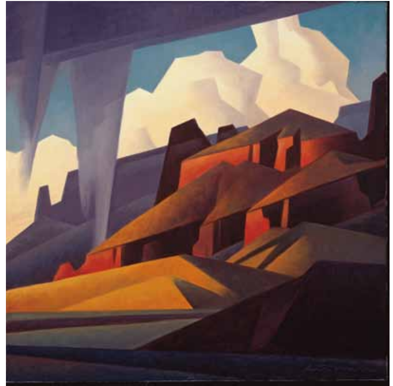
Ascending Mesas , d.2011, oil on linen, 22 x 22 inches