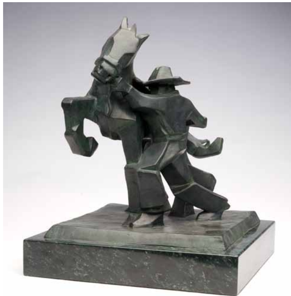
Sidestepper , d. 2009, number 30, bronze, 15 x 11 x 11 inches