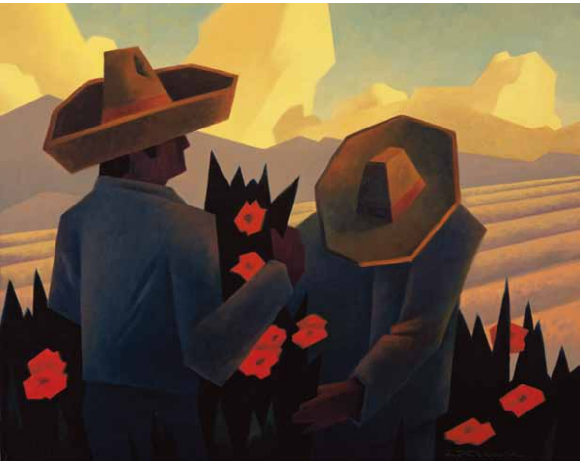
Floral Harvest , d.2011, oil on linen, 20 x 25 inches