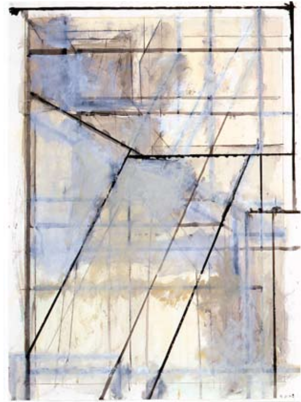
Richard Diebenkorn (1922-1993) Untitled, Ocean Park , d. 1974, acrylic on paper, 28 7/8 x 21 1/8 inches