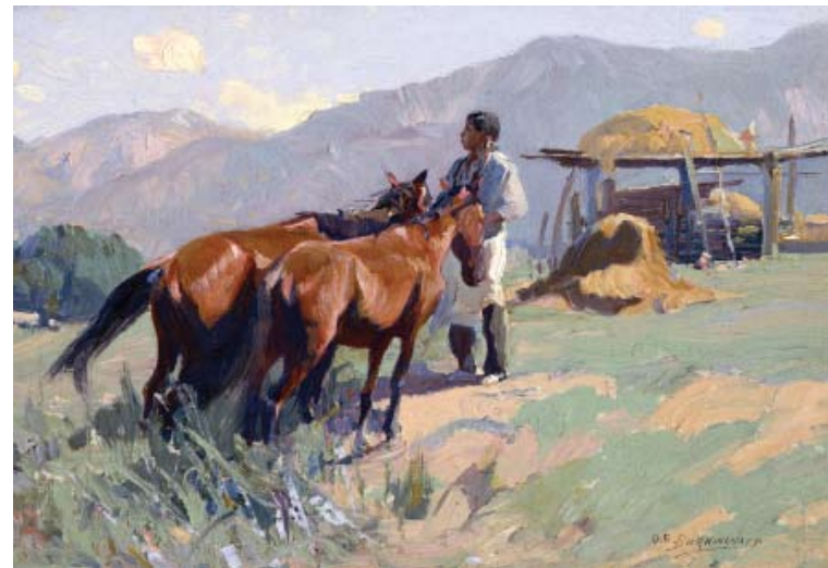
Oscar Berninghaus (1874-1952) Feeding the Horses, New Mexico , oil on canvas, 9 x 13 inches