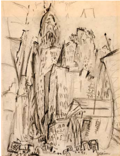
John Marin (1877-1943) Woolworth Building , graphite on paper, 9 5/8 x 7 5/8 inches