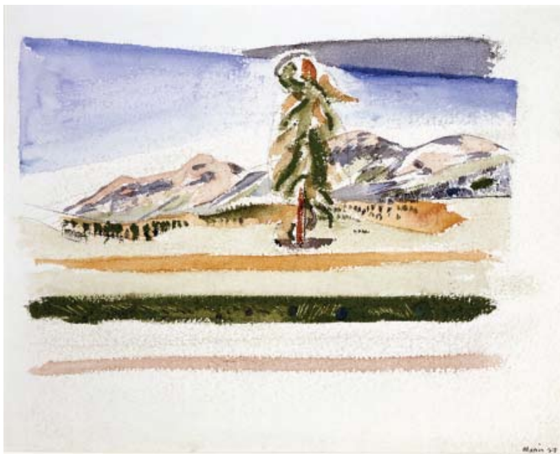
John Marin (1877-1943) The Tree, New Mexico , d. 1929, watercolor on paper, 15 x 18 7/8 inches