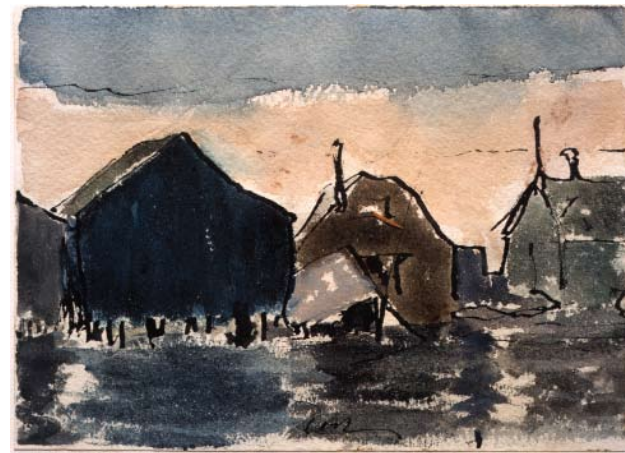
Arthur Dove (1880-1946) Along the Pier , watercolor on paper, 5 x 7 inches