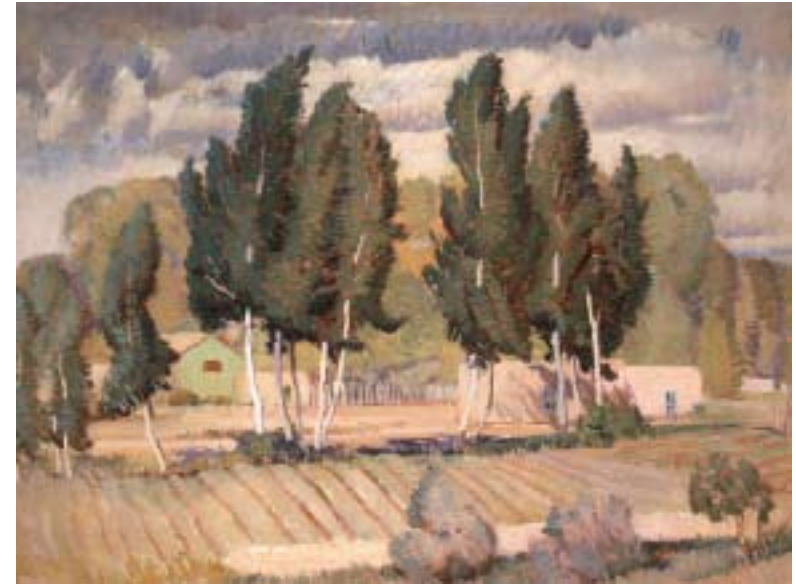
Victor Higgins (1884-1949) Sunlit Trees , oil on canvas, 22 1/4 x 29 1/4 inches