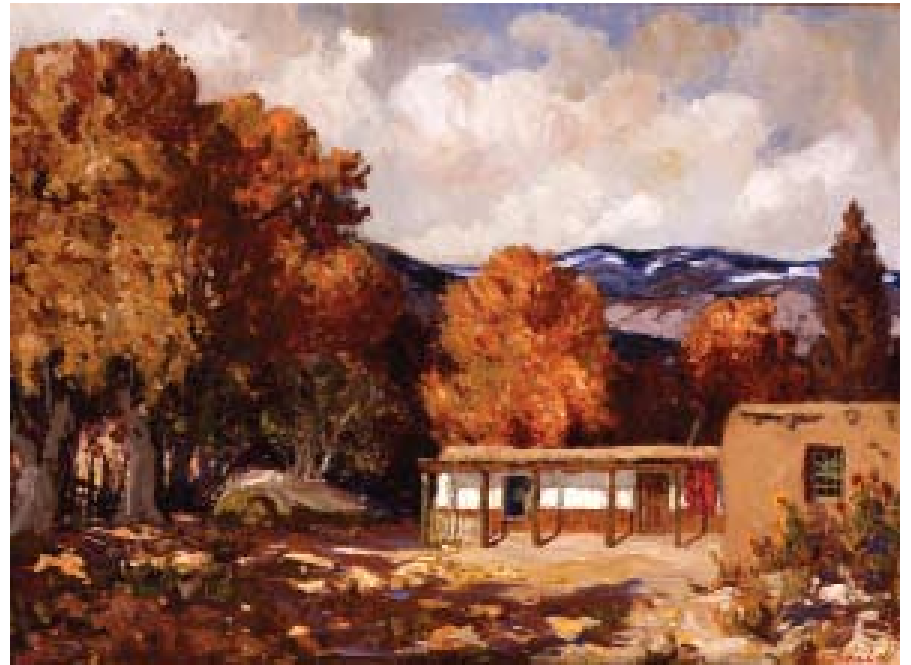
Fremont Ellis (1897-1985) Autumn, Cienega , oil on canvas, 22 x 30 inches