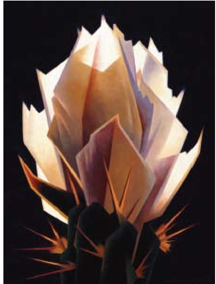
Ed Mell (b. 1942) Desert Diamond , oil on linen, 40 x 30 inches