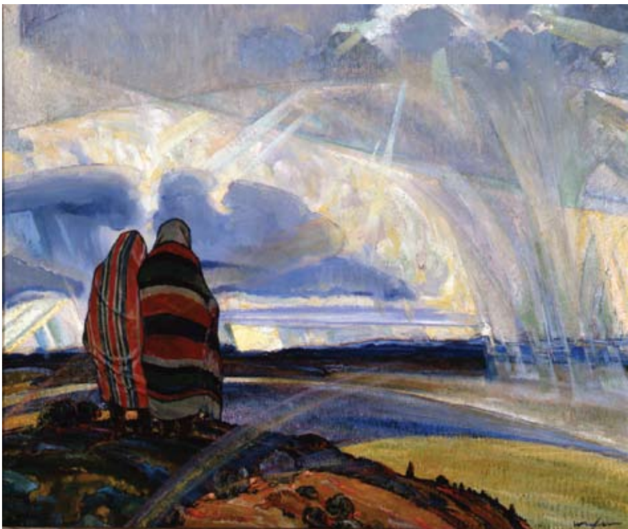
Walter Ufer (1876-1936) Fructuations , c. 1920, oil on canvas, 25 x 30 inches