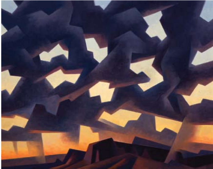
Ed Mell (b.1942) Cloud Matrix , oil on linen, 20 x 24 inches